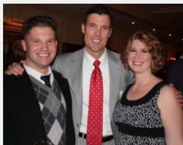
Members network at the chapter holiday party.