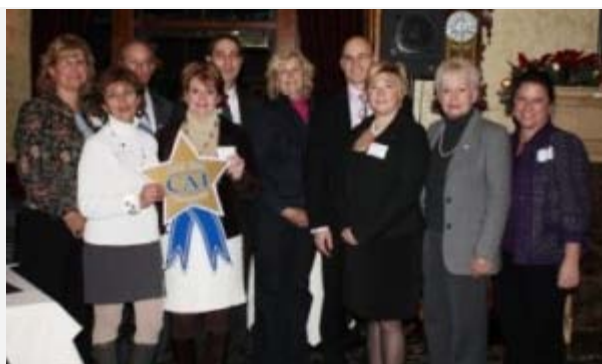
Representatives of new and existing Gold Star communities gather for a group photo.

Birchfield Community Services Association Pine Crest Community Association Waterfront Square-The Peninsula Tower Waterfront Square-The Regatta Tower Woodlake at Kings Grant Condo Association